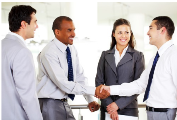
BUSINESS SOFT SKILLS

We Connect Institutions and Industry in the Following Areas