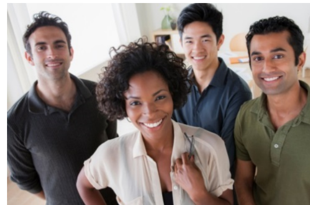
ADULT BASIC SKILLS